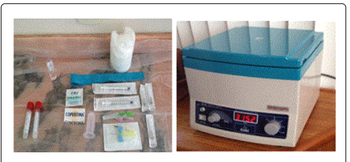
Figure 2: Syringes to be used and Centrifuge used for separation of blood cells.

Your goals were achieved with this protocol-Very pleased: Yes/No; Not pleased: Yes/No