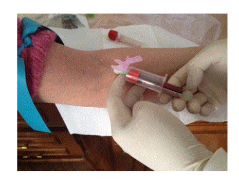
Figure 3: Collection of peripheral blood from the arm.

Peripheral blood was drawn from the arm (Figure 3) and a numbing cream Benzocaine 20%; Lidocaine 6%; Tetracaine 4% was used in the vulvo vaginal area.