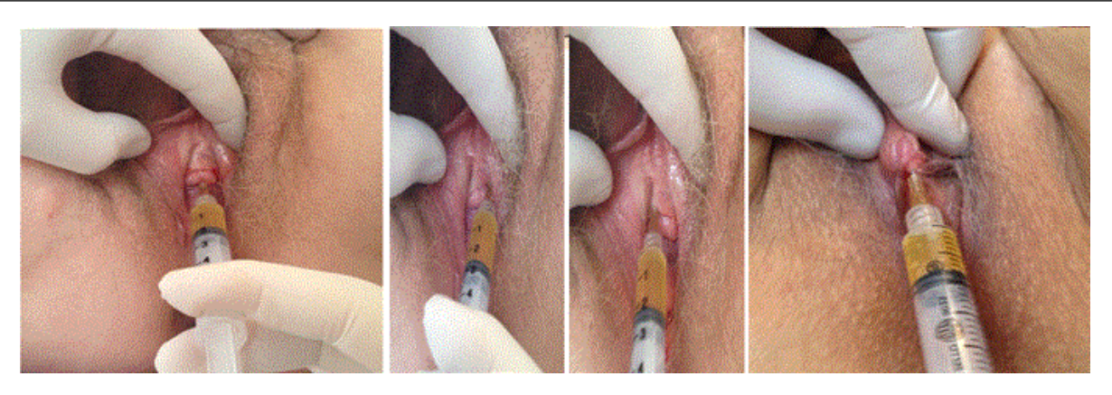
Figure 6: Procedure for PRP injection.